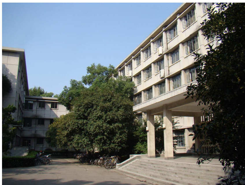
The location of the future EU-China Institute for Clean and Renewable Energy on the campus of HUST

Last but not least, the research support platform was a strong wish of both the Chinese and the European sides, and aims at achieving the goal of fostering long-term scientific cooperation between EU and Chinese top researchers. This interactive cooperation platform will be open to all energy experts from Chinese and EU universities and facilitate exchange of PhD students between EU and Chinese universities, co-supervision of research activities, initiation of joint research projects, etc.